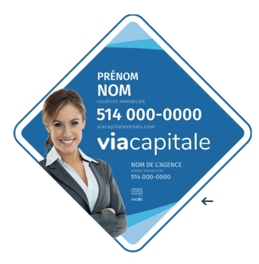
(The use of French in the demo is for viewing purposes only)

Business card (The use of French in the demo is for viewing purposes only)